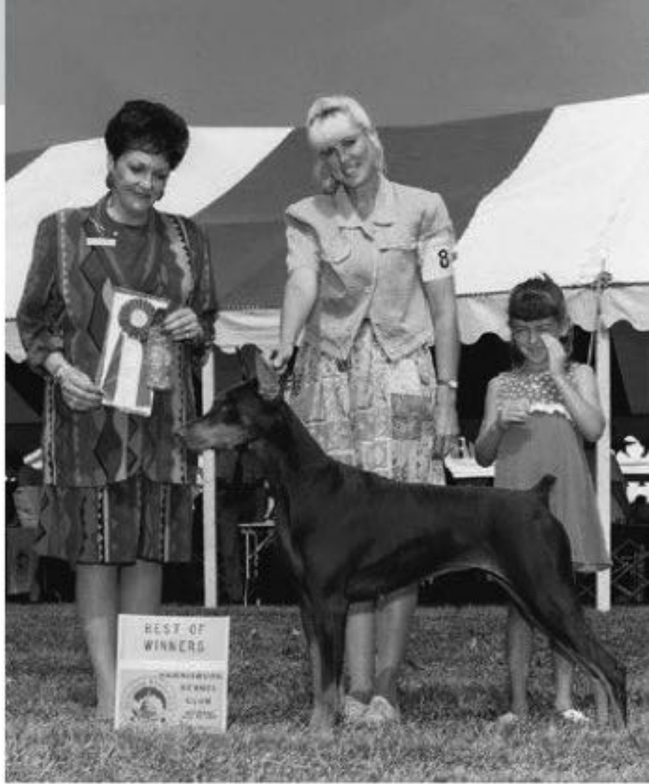
CH. Kelview's Final Inquest "Juri"