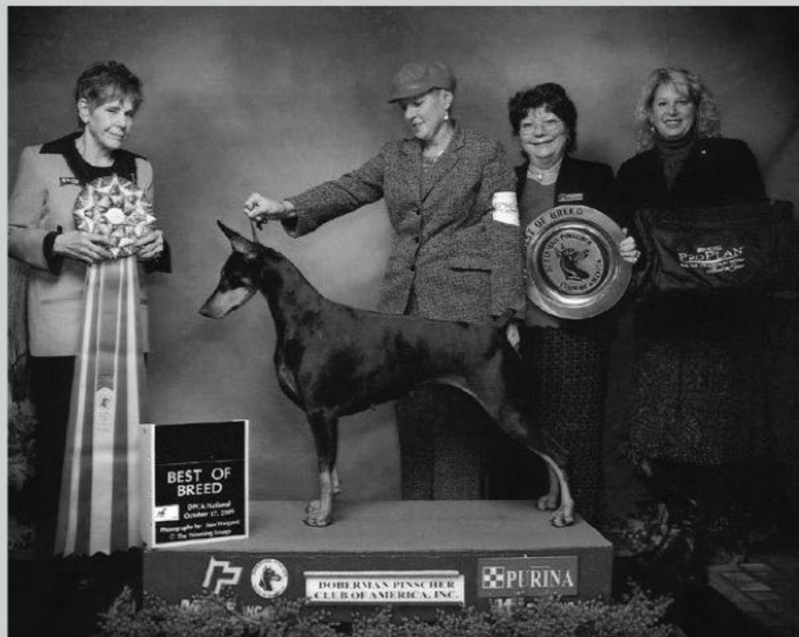
CH. Triadel's After Tomorrow "Tommy"