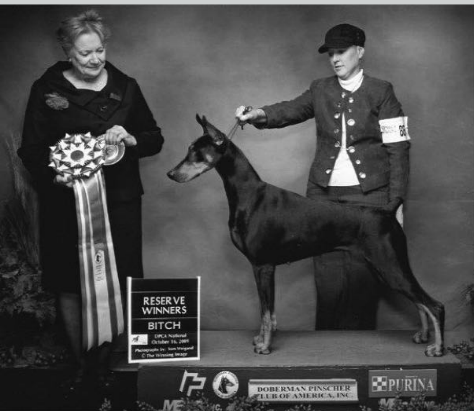
BISS Am GCH Can GCH Kelview's Gemini V. Nova "Gemmi"