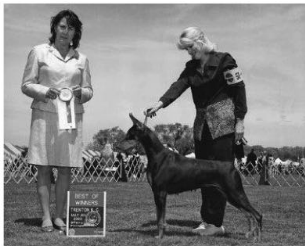
CH. Kelview's Brenna V. Nova "Brenna"