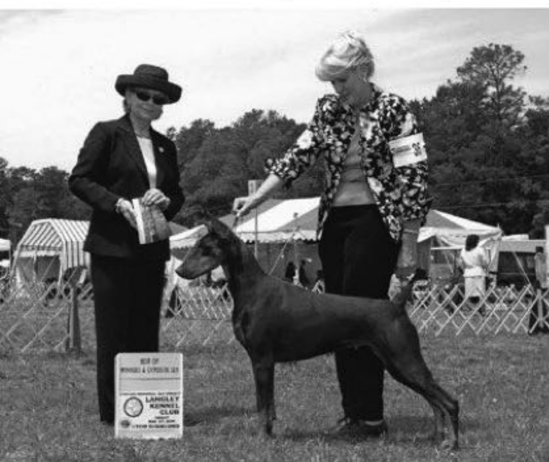
CH. Kelview's Dynasty V. Nova "Dynasty"